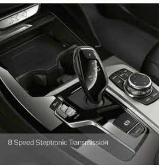
8 Speed Steptronic Transmission