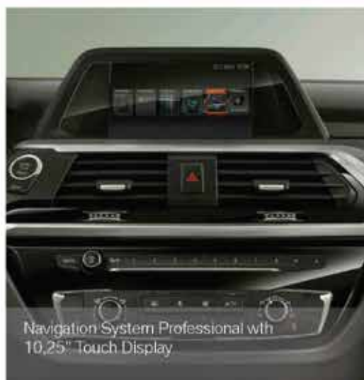
Navigation System Professional with 10.25" Touch Display