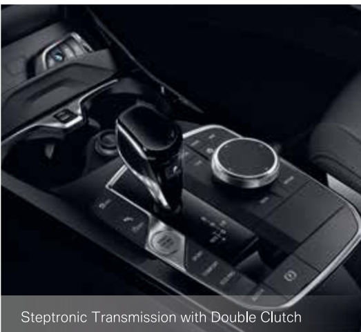
Steptronic Transmission with Double Clutch