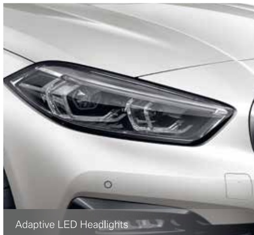
Adaptive LED Headlights